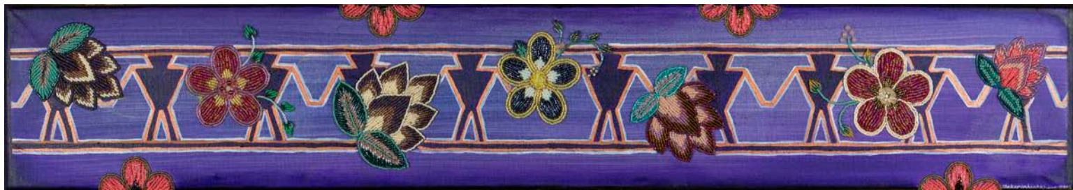
Annual General Assembly artwork: Tekaronhiahkhwa Standup. (2015). United . [Acrylic on canvas with seed and Delica seed beads. 6" x 36"] Collection of the Assembly of First Nations, Ottawa, ON.

The Assembly of First Nations acknowledges Scotiabank as the annual report sponsor.