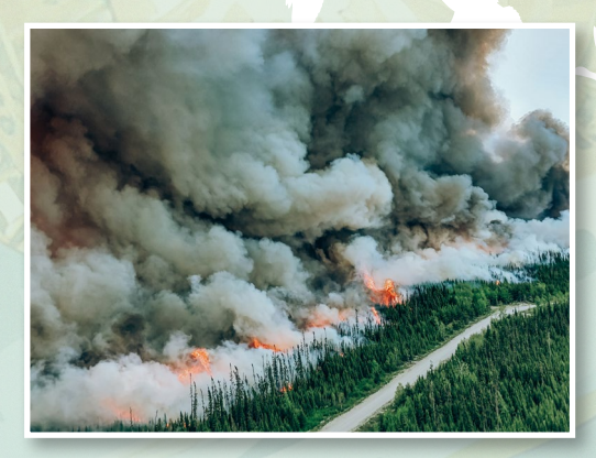
Photo of fire 334 taken on June 6, 2023

For the First Nations of Québec, the climate challenge is significant: coastal erosion and submersion, flooding, change in the abundance and distribution of species, loss of ancestral sites, food insecurity, health problems, etc.